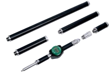
Carbon Fiber Bore Gauges