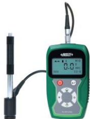
Leeb Hardness Testers