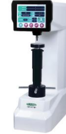
Rockwell Hardness Testers