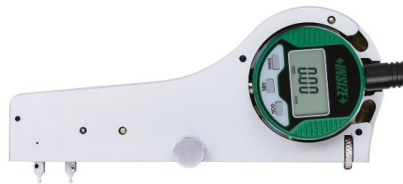
Digital Thread Pitch Measuring Instruments