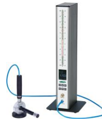
Air Gauge And Displays