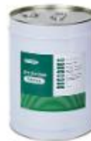
Fluorescent Penetrant Fluids