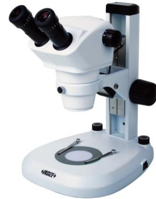
Zoom Stereo Microscopes