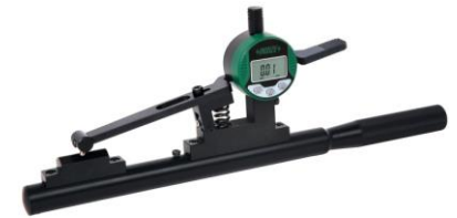
Digital Thread Height Measuring Instruments