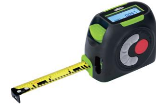
Wireless Digital Measuring Tapes + Laser Distance Meters