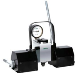
Magnetic Brinell Hardness Testers