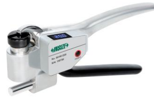
Aluminum Hardness Testers