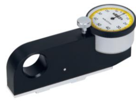
Buttress Thread Tooth Thickness Gauges