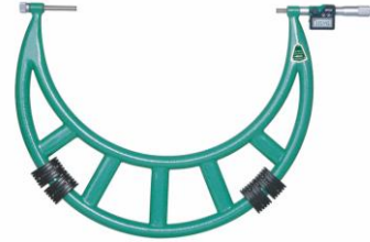
Digital Outside Micrometers